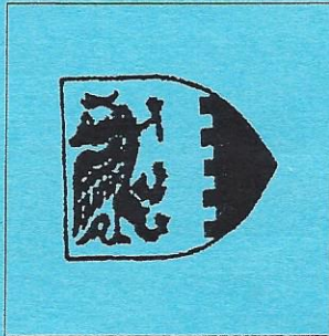
Badge of the Shire of Windkeep

Newsletter of the Shire of Windkeep. (Cheyenne, WY) % 10205 Powderhouse Road Cheyenne, Wyoming 82009-9689