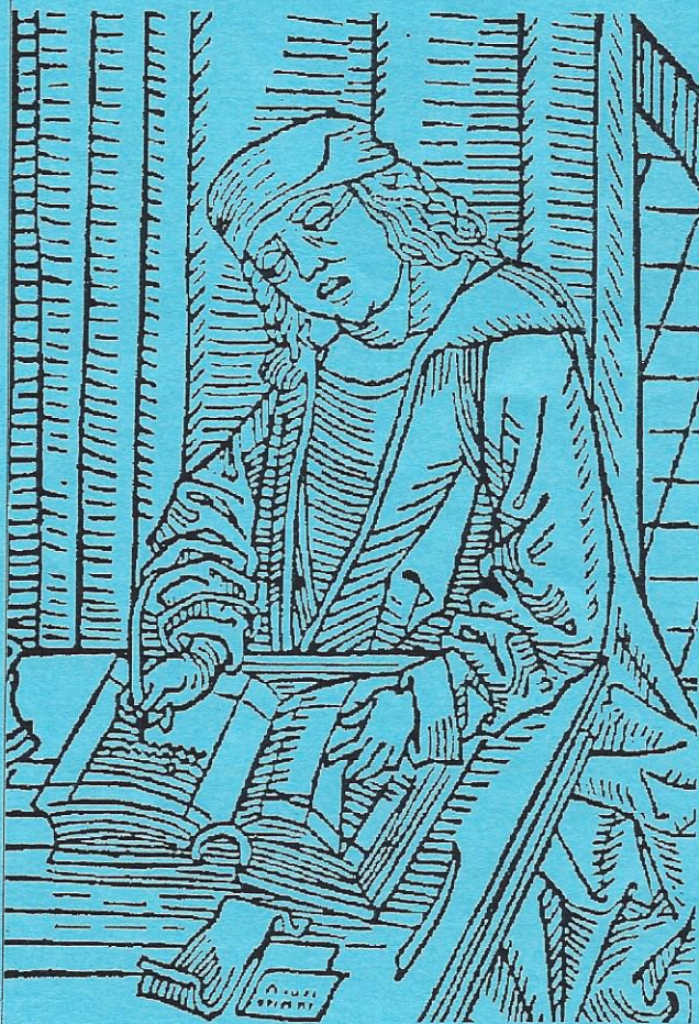
"Medieval Life Illustrations" by C.B. Grafton Dover Publications