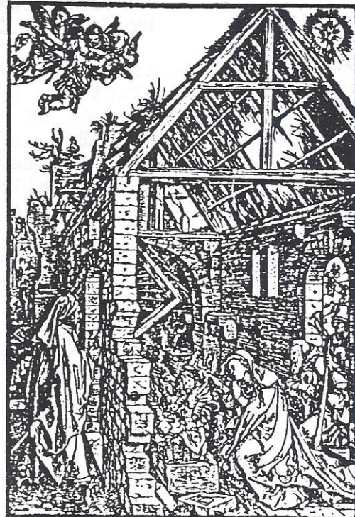
Albrecht Dürer made this interesting woodcut of the stable showing the Holy Family, the shepherds, and the heavenly host