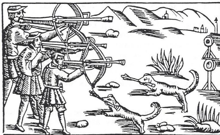
FIG. 15.—CROSSBOWMEN PRACTISING AT THE TARGET.

Their dogs are retrieving the arrows, and were trained to do this without injuring the feathers of the missiles.