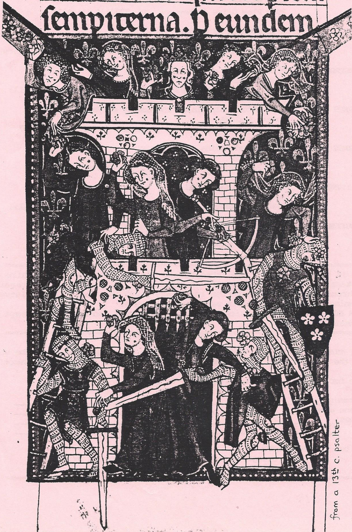
from a 13th c. psalter

annuabus quiete p̄firu sempiterna. p̄ eundem