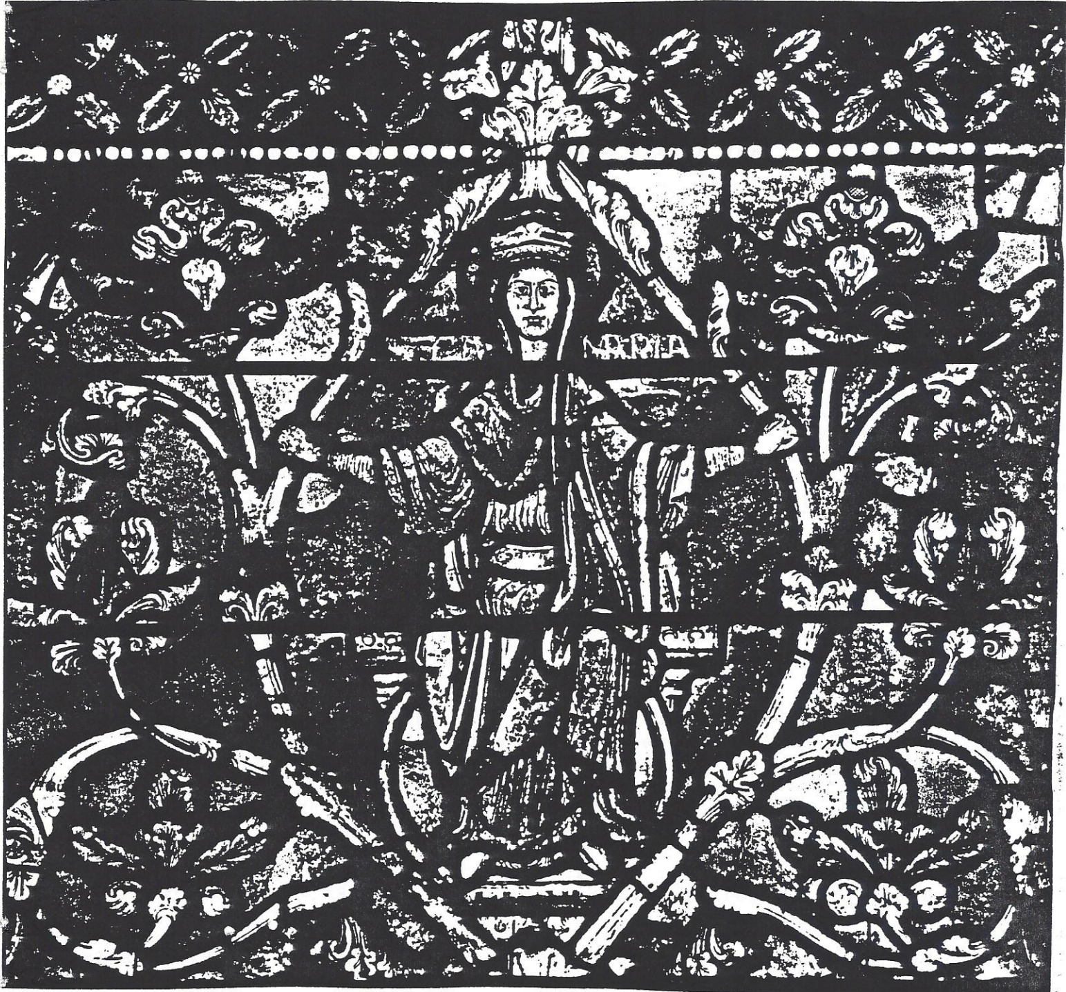
The Virgin Mary Late 12th century. Canterbury Cathedral. North window of the corona. Detail from a Jesse window